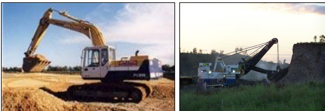
Fig. 6-1 Illustrates a Crawler-Mounted Shovel

Power shovels may be mounted on rubber tired wheels.